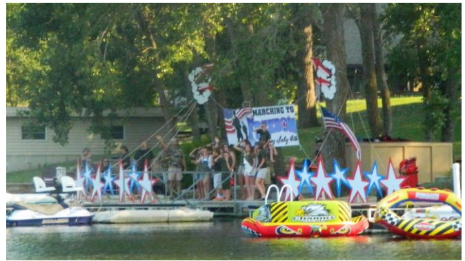
3rd place Lakefront: Forker HS/2